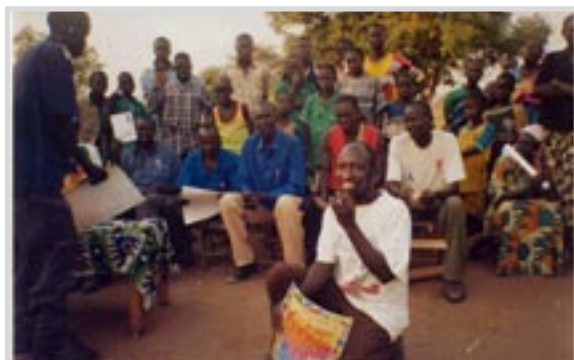
One of IRC's Community Dialogues

IRC's Youth Life Skills club successfully held three debates and three public dialogues about GBV and HIV/AIDS.