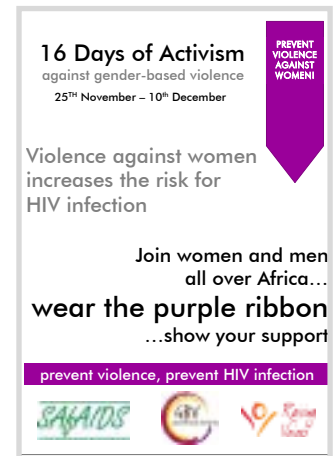
Network Flyer explaining the Ribbon Campaign

Most of the organizations reported distributing the ribbons to the same groups as in the table above. Many more ribbons were included in the Kits than posters so this allowed NGOs to reach out to many more community members and stakeholders. The ribbons encouraged an individual commitment to preventing violence, as wearing one is a personal decision. According to CEDOVIP, “ Ribbons were seen throughout the community and Kampala during 16 Days, they were in such demand, staff and community volunteers had to keep giving away their ribbons on buses and while walking through town as people would stop them and request it! ” CEDOVIP also reported that many journalists on national TV wore the ribbon during newscasts and programs throughout the 16 Days.