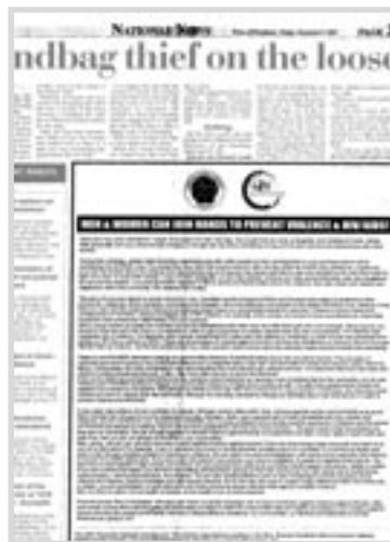
Newspaper Article, as published by FLAS

A newspaper article (see appendix 1) was included in the Kit to encourage collaborating organizations to reach out to larger audiences through the media. The newspaper column was designed to stimulate broader dialogue on the link between violence and HIV as well as to provide deeper analysis into the issues. The focus of the article was on how and why men should get involved in preventing HIV/AIDS and VAW. The article, as with the other communication materials, used a benefits-based approach to involving men. The article described how violence is both a cause and consequence of HIV/AIDS and how men could play an active and positive role in making families safer, happier and healthier.