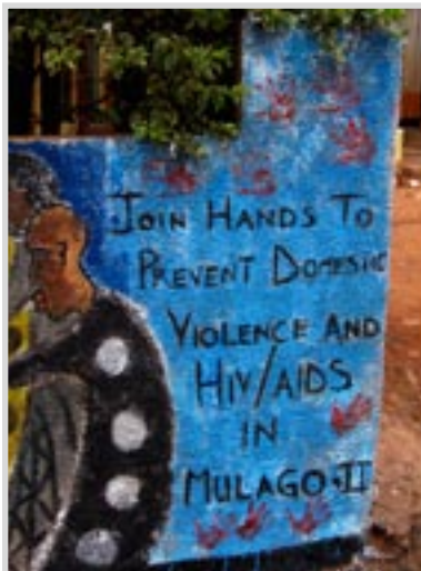
One of CEDOVIP's new Murals

The media (radio stations) kept domestic violence issues in the limelight. Many community members resolved to encourage each other to take action against DV and urged their LCs to sign the DV bylaw and parishes also signed the bylaws. Many men were continuously engaged through activities like sporting events, peer to peer discussions, and couples seminars, which saw many of them committing to supporting the causes of preventing DV. CEDOVIP also launched a three new men's murals with an HIV positive men's group calling for men in the community to open up and take action against violence and HIV.