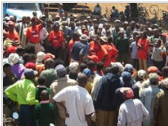
One of Men-to-Men's many activities during its Traveling Conference

The campaign was successfully conducted as planned. Through the campaign, broad media coverage was essential, both printed and electronic. They collaborated and networked with