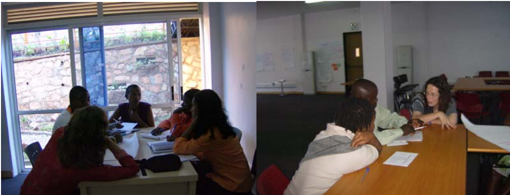
Participants in group discussions during the meeting

The meeting was conducted in a participatory manner to ensure input from all participants. Various sessions were held that took the participants through various sessions for two days including 1 : introductions, overview of the GBV Prevention Network, motivations and intentions of joining the Network, working together (challenges and successes) and way forward for the Network and all her structures.